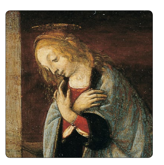
Attributed to Lorenzo di Credi (after a design by Leonardo?) The Annunciation (detail of the Virgin) c.1478, tempera and oil on poplar panel, Musée du Louvre, Paris

Scottish National Gallery, Edinburgh, inv. NG 2338