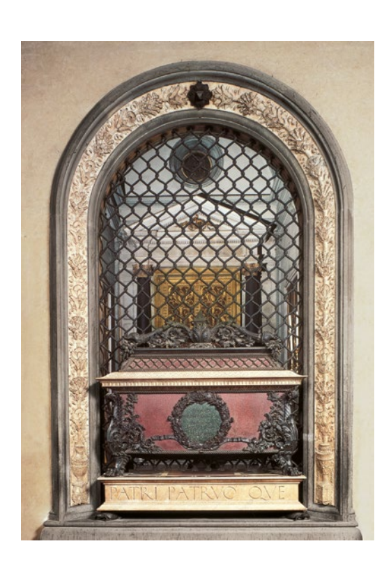
Andrea del Verrocchio (with the participation of Leonardo's workshop) Tomb of Giovanni de' Medici 1469–72, marble, bronze, porphyry and pietra serena,

c.1470–75, grey tempera and lead-white heightening on grey prepared linen canvas, Uffizi Gallery, Gabinetto dei Disegni e delle Stampe, Florence, inv. 433 It is interesting to compare this with the drapery in Verrocchio's sculptures.