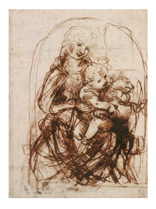
Sketch for a Virgin and Christ Child with a cat .1480, pen and brown ink over a stylus underdrawing, British Museum, London, inv. 1865,0621.1V

Life studies for a Madonna and Child with a cat c.1480, pen and brown ink over traces of metalpoint, British Museum, London, inv. 1857,0110.1